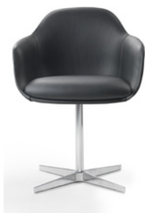
Versione B Base girevole in metallo a 4 razze Versione B Swivel 4-star metal base