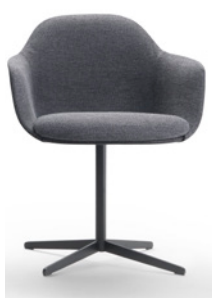
Versione A Base girevole in metallo a 4 razze Versione A Swivel 4-star metal base

Третий вариант предполагает каркас из металлического профиля, покрытого слоем огнеупорного пенополиуретана холодного отверждения класса 11M. Подушка сиденья имеет основу из Baydur® 80IK28/DO и наполнение из вспененного полиуретана плотностью 40 кг/м³ (5,9 Кпа), обернутого в акриловое волокно. Обивка подушки несъемная. Вращающееся металлическое основание имеет 4 опоры либо 5 опор на колесиках. Baydur® - полимерный материал, производимый концерном Bayer.