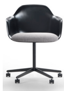
Versione C Base girevole in metallo a 5 razze con rotelle Versione C Swivel 5-star metal base with castors