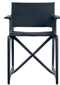
Frame: Black 1765 C Seat + Back: Black F-758