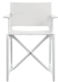
Frame: White 1735 C Seat + Back: White F-738