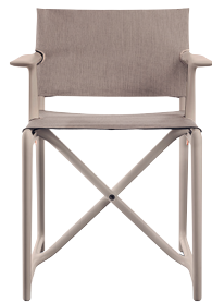
Frame: Beige 1733 C Seat + Back: Beige F-458