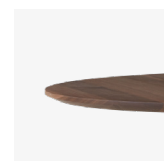
→ Oiled Walnut