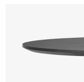
→ Black Lacquered Oak