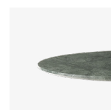
→ Verde Guatemala Marble