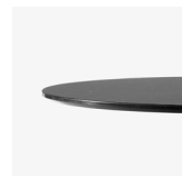
→ Nero Marquina Marble