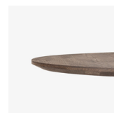
→ Smoked Oiled Oak