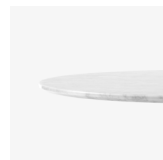
→ Bianco Carrara Marble