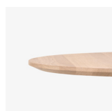
→ Oiled Oak