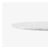
→ Bianco Carrara Marble